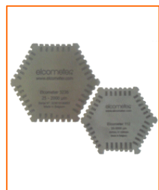
Elcometer 112 & 3236

The Elcometer 154 Wet Film Combs are made from ABS plastic and are designed to be used once and kept as a record of wet film thickness measurement for quality assurance or customer requirements.