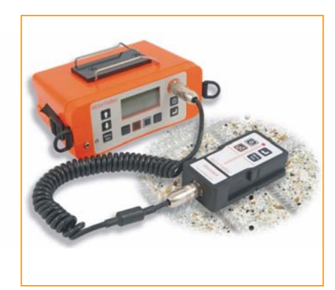
Elcometer 3312 Covermeter with Half-Cell